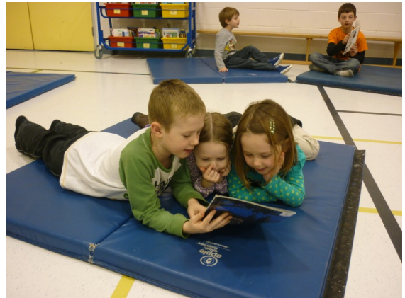
Spending Quality Time with the Family!