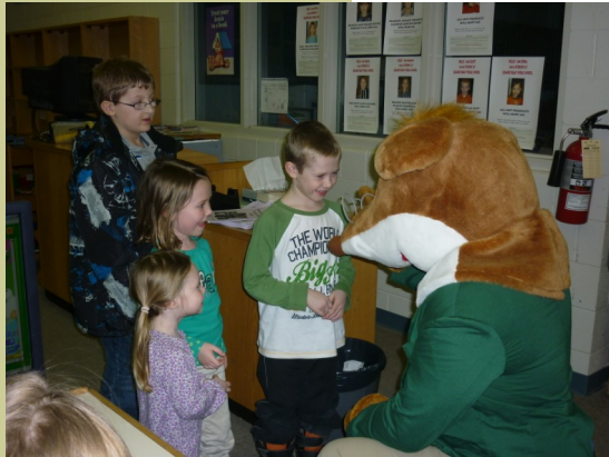
A visit from Geronimo Stilton!