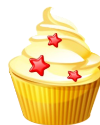
CUPCAKE DAY– Feb. 10