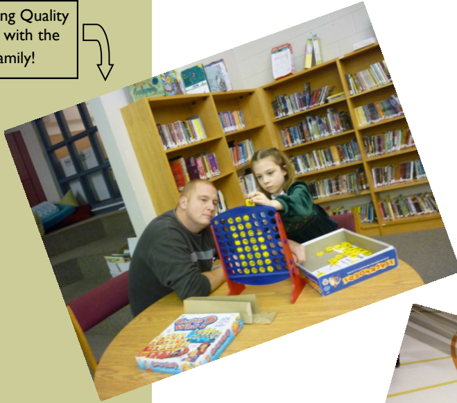
Spending Quality Time with the Family!